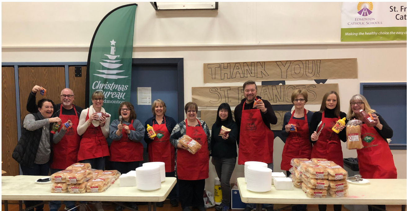
Members of the Christmas Bureau Board and volunteers giving back to St. Francis of Assisi Elementary School - a hotdog thank you party!

We are also very grateful to St. Francis of Assisi Elementary School who, every year, give up part of their school for a week in December so that we can manage our hamper program. To the staff and students, we are extremely grateful for your support.